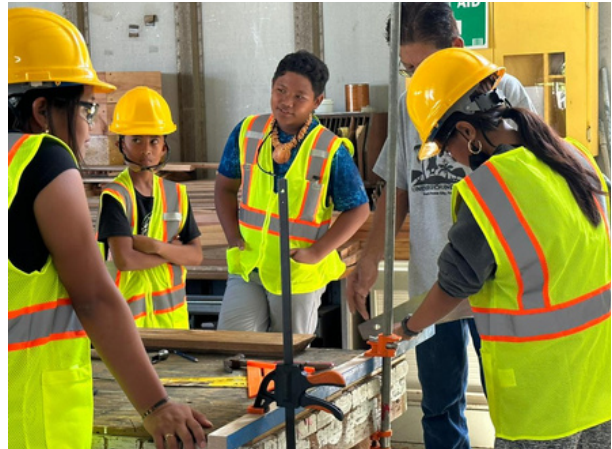
Our Trading Up: Core students from Tanapag Middle School (TMS) getting hands-on learning about some of the hand tools and power tools used in the construction industry.