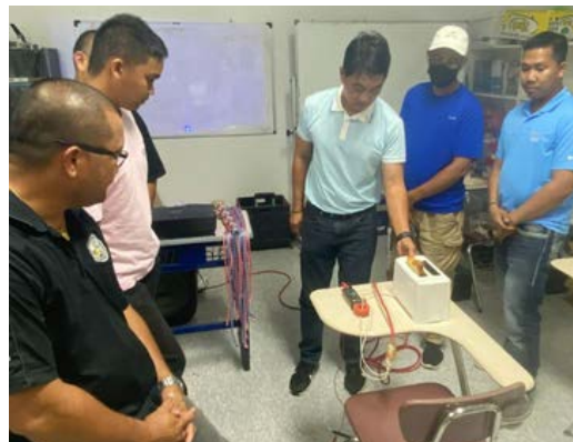
Electrical Level 1 students learned about electricity in our every-day technology and appliances.