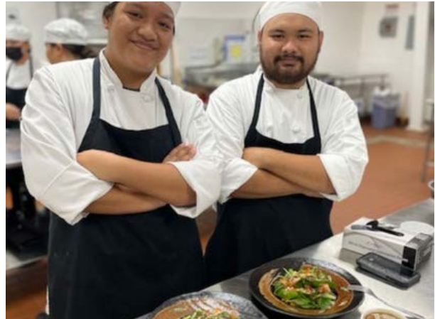
Culinary Arts II students learned how to make salad dressings and how to properly compose a salad.