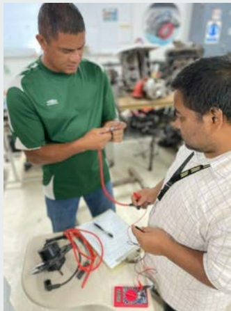
Our Automotive Technology: Engine Performance students learned how to use volt meters to test and check the resistance of coil windings.