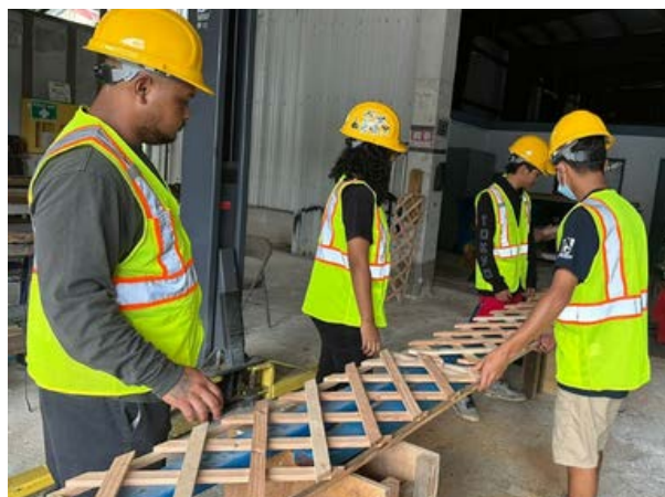
Our Trading Up: Construction Craft Laborer students from Da'ok Academy constructed a wooden partition that will be used around campus.