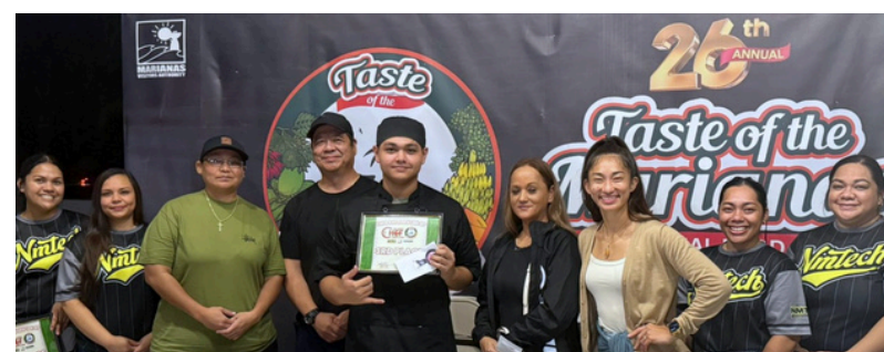
former student; Cook at Crowne Plaza Resort