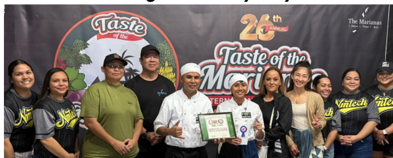
Both are current students